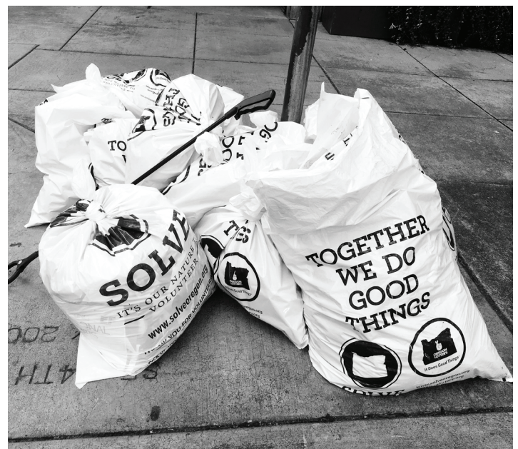
Collected bags of litter.