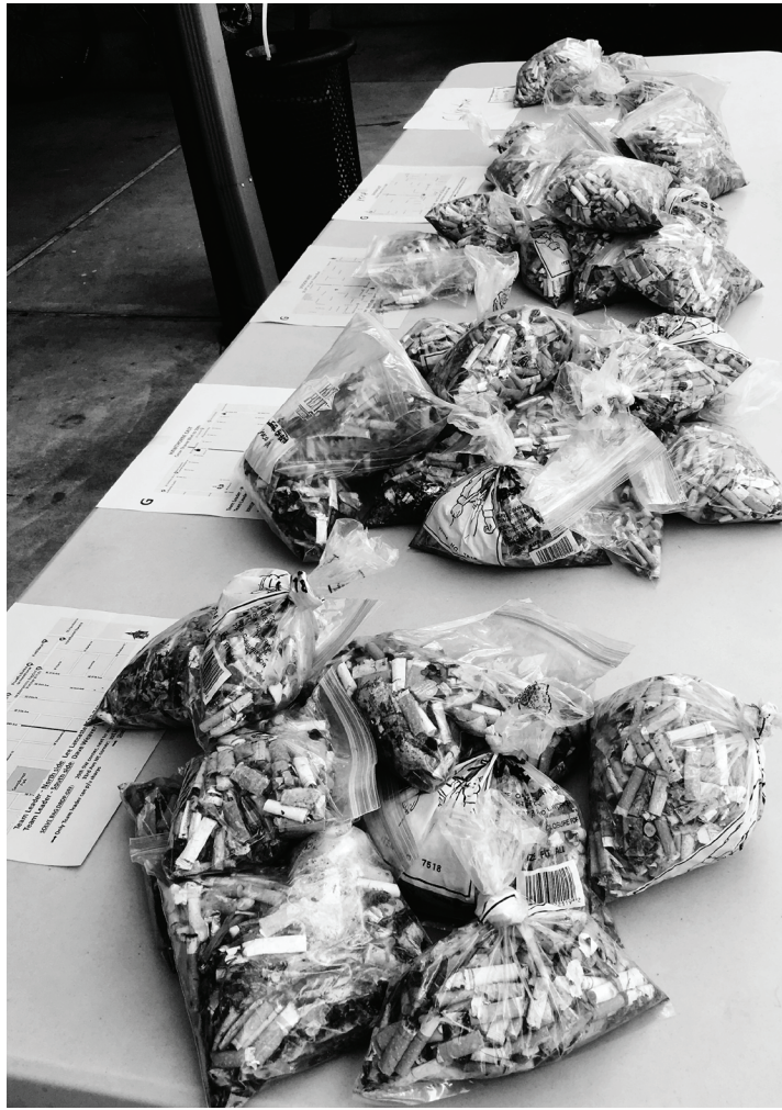
Bags of cigarettes that were collected.