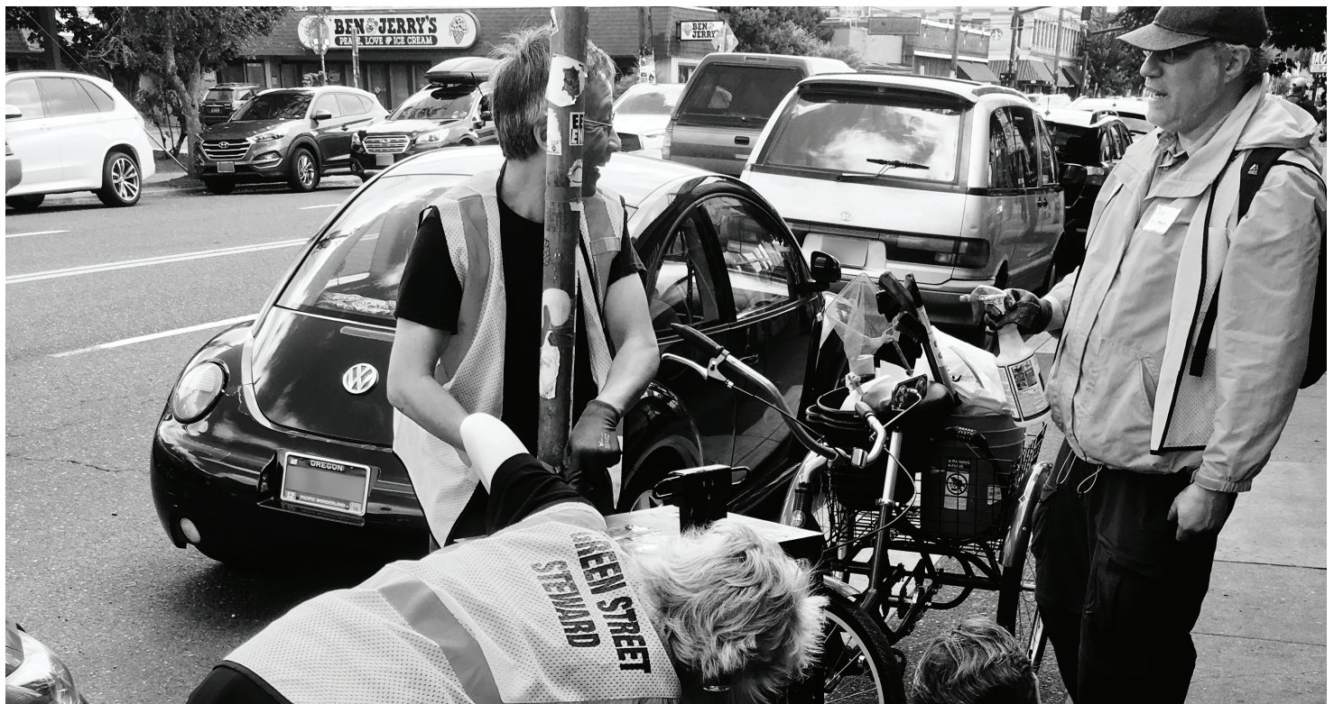
Cleaning the stickers off of signposts on Hawthorne Blvd.