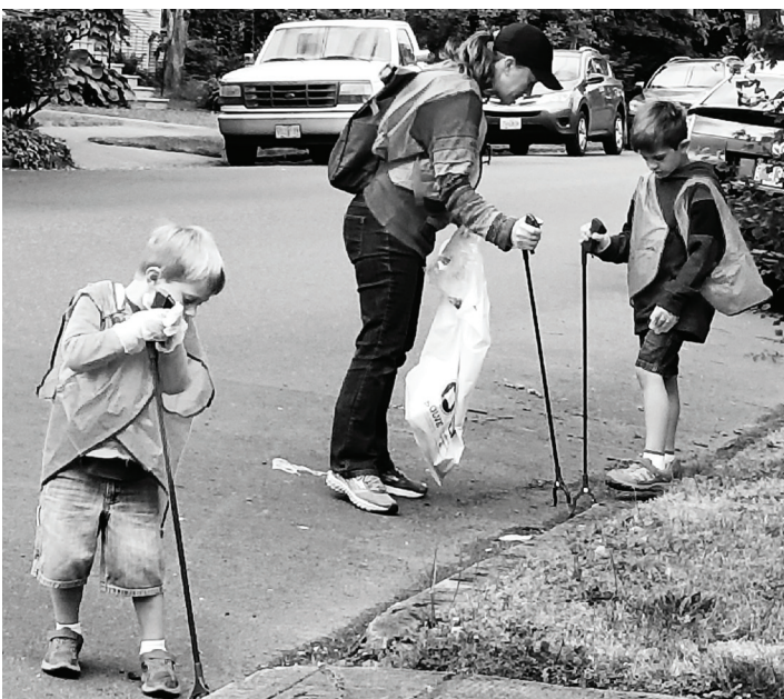
A family doing their part in helping the community.

Special thanks to: New Seasons Market, Fred Meyer, Pepino's Mexican Grill, Aprisa Mexican Cuisine, Imperfect Produce, Grand Central Bakery, Petit Provence and Starbucks Hawthorne & 38th, Starbucks Safeway on Hawthorne for providing food, drink and snacks for the volunteers; to Ruby Jewel for providing the ice cream sandwich prizes for the cigarette-butt collecting contest; to Graffiti Removal Services for the graffiti-removal training; and to the following businesses for donating raffle prizes: Mink, Imelda's, Kids at Heart, Pizza Oasis, Portland Bicycle Emporium, Marino's, Rudy's Barbershop, Townshend's Teas, Stella Taco, KaTi Thai, For Paws, Hawthorne Gardens, Eb & Bean, Saint Honoré Bakery, KINK FM, Presents of Mind, Collage, Xico, Roosevelt's Terrariums, and Fyberworks Boutique.