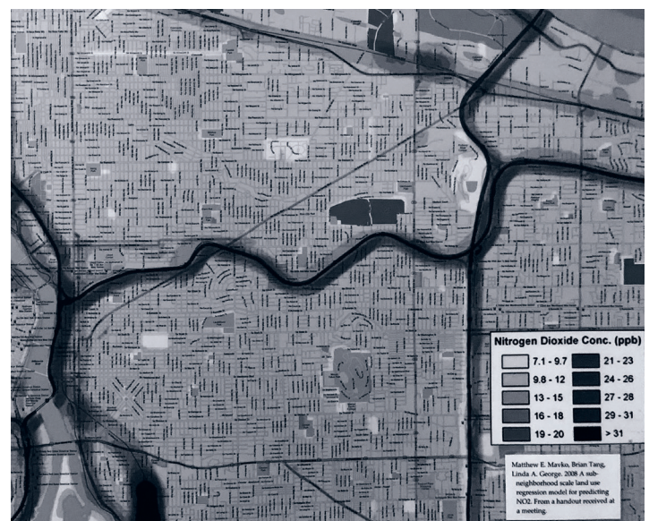
Nitrogen Dioxide Concentrations around East Portland.